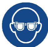
Tightly sealed goggles